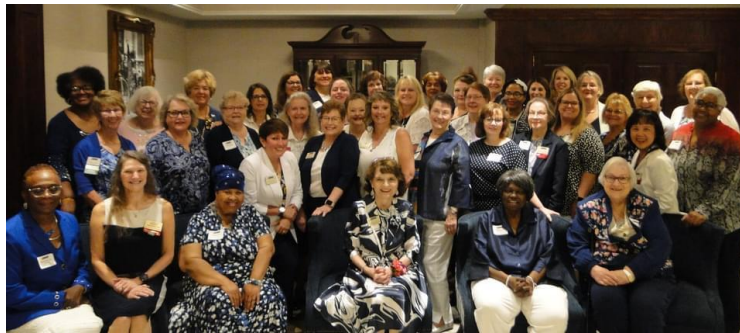
Eastern Michigan Council members attending the event